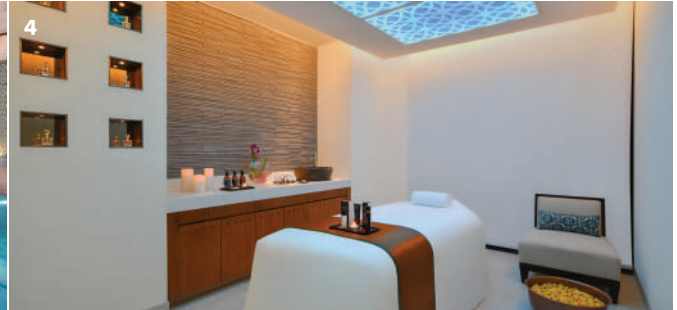
1. Souq Suite Living — 2. Superior Room — 3. Temperature Controlled Pool — 4. M|Spa

Alwaha Ballroom — Alwaha Ballroom is a sublime venue for weddings, gala events, receptions, corporate social events and other special occasions in Qatar. This glorious space, which floods with natural daylight, can accommodate up to 415 guests in a cocktail set-up. And to accommodate your needs, the ballroom can also be divided into two elegant venues, with chic modern design and tastefully decorated to evoke Qatari heritage.