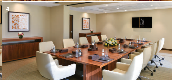
1. 2. Alwaha Ballroom — 3. 4. Meeting Rooms