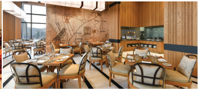
1. Atteitude — 2. O'Glacée — 3. Sofra — 4. Le Colonial

Restaurants — Alwadi Hotel Doha MGallery Hotel Collection offers 3 Restaurants, 2 bars and a lobby lounge. Savor a meal at Alwadi Hotel Doha to understand the essence of Qatari hospitality. The flavors of the Gulf region will delight you as you enjoy moments with family, friends and business colleagues. For breakfast, lunch, dinner, drinks and late-night snacks – good times and good taste start here.